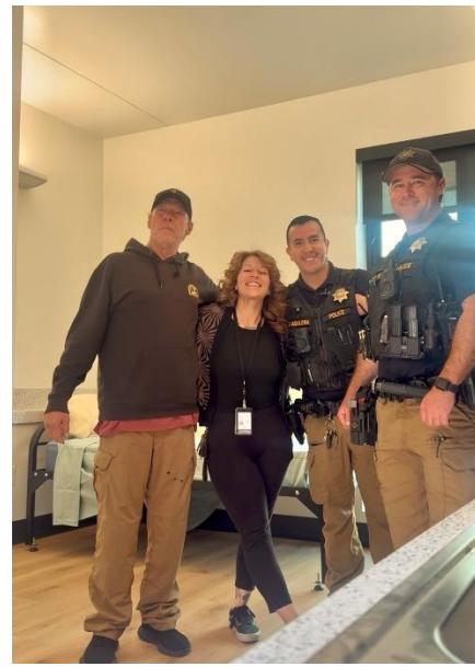
March 27, 2026 - Clean and Safe Outreach and Sparks Hope Team facilitated a move-in to Cares Campus Permanent Supportive Housing (PSH) unit.