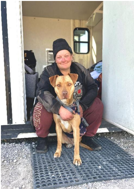
March 11, 2026 - Clean and Safe Outreach facilitated a move-in to Safe Camp.