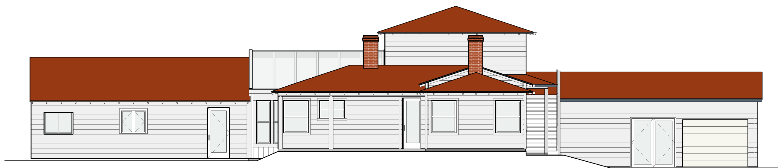
EAST ELEVATION - EXISTING