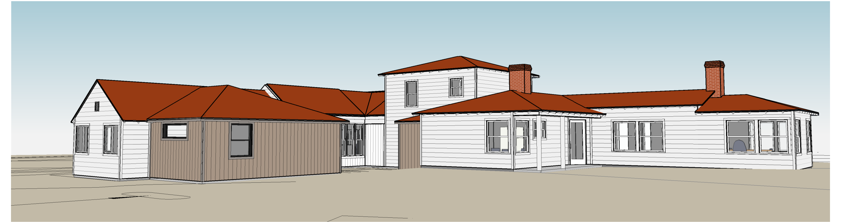
3D VIEW - PROPOSED