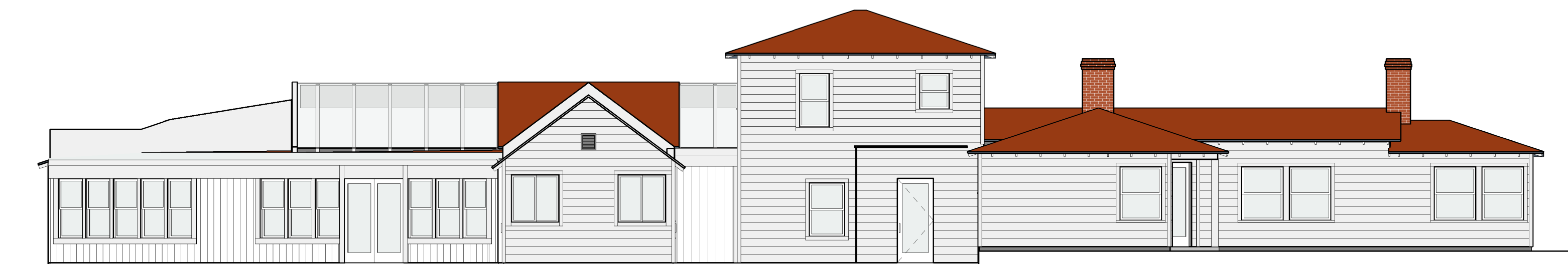
SOUTH ELEVATION - EXISTING