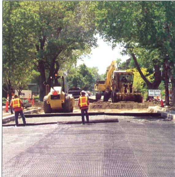
Granite Construction dug up 26 city blocks around the Veterans Medical Center and replaced gutters, sidewalks and roadways during 75 days of construction. Construction crews often helped residents by carrying items to their homes.